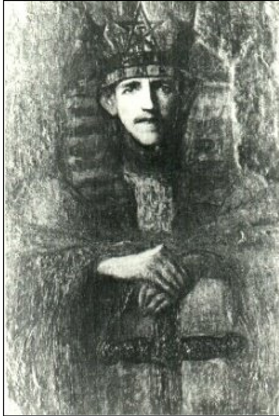
Samuel Liddell Macgregor Mathers